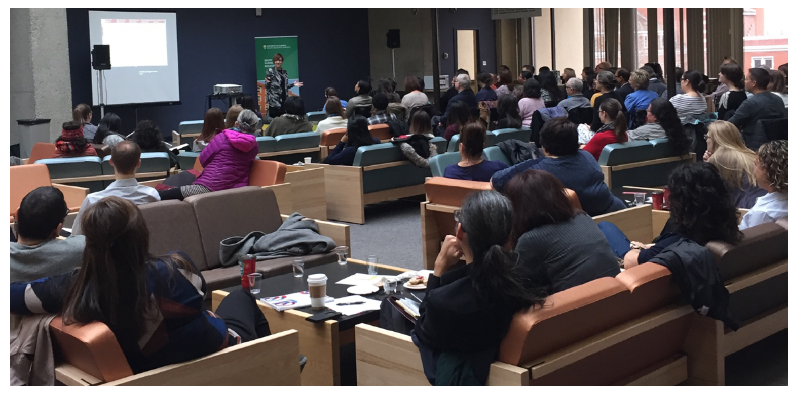
Attentive audience at public talk on the Canadian Human Rights Tribunal on First Nations Child welfare