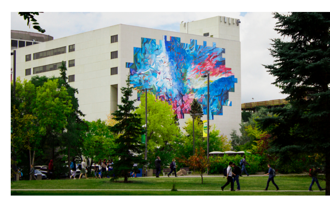
Faculty of Education building