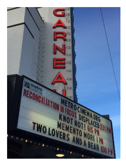
(Dis)placed on the Garneau Theatre's Marquee