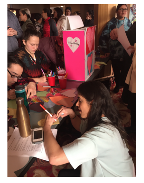
Audience members write valentine's to PM during intermission