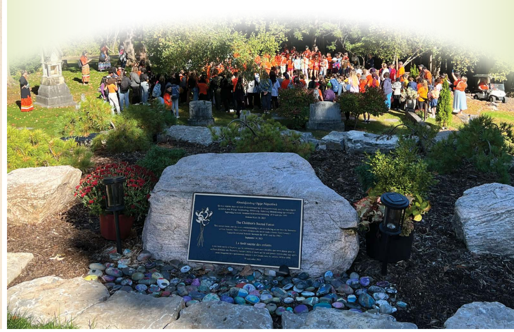
(Below) The Children's Sacred Forest honouring children who never returned from residential schools with tour participants in the background listening to A7G tour guides.

Every day of the year, we invite people to learn about Canada's past in the spirit of the Truth and Reconciliation Commission and its Calls to Action through our campaign, Reconciling History, available at fncaringsociety.com/reconciling-history .