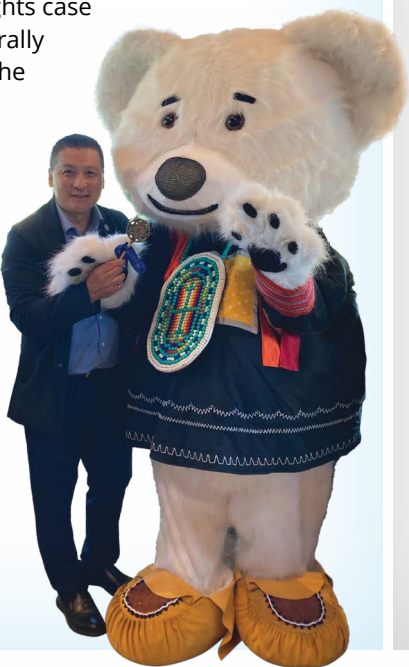
(Right) Mayor Yu handing Spirit Bear the Key to the City.

To find out more about the exhibit and read the Spirit Bear Day Proclamation, visit the exhibit webpage at fncaringsociety.com/spirit-bear/spirit-bear-and-children-make-history-exhibit .