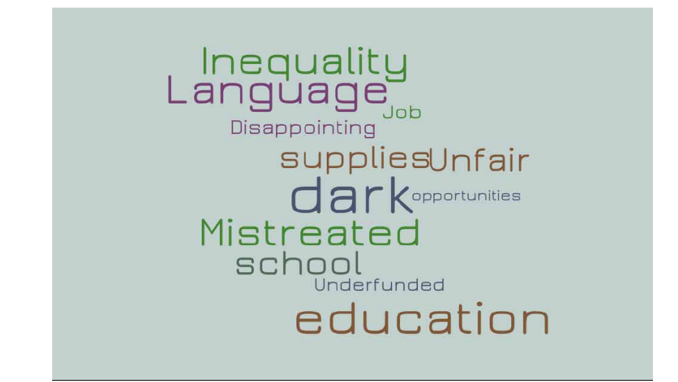
Figure 4: Word cloud for sub-theme 4: Truth and reconciliation

The image below displays keywords taken from the students' written notes about this sub-theme: