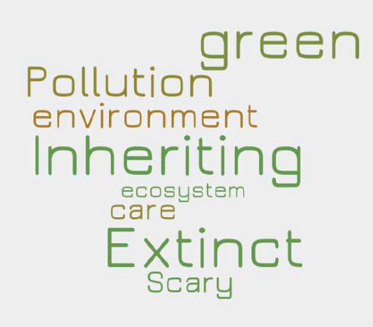
Figure 1. Word cloud for sub-theme 1: Environment / climate change

The following picture displays key words from the students' conversations.